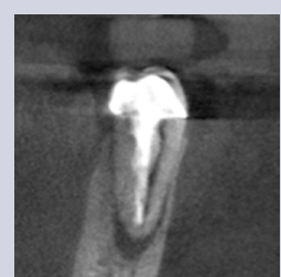
Fig. 5b. Coronal CBCT slice of the same tooth revealing a missed buccal canal and an associated apical radiolucency.