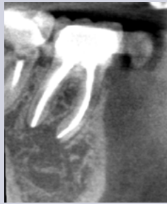
Fig. 2b. Sagittal CBCT slice of tooth #30. Note extensive periapical radiolucency.

CBCT, however, can reveal bone defects of the cancellous bone and cortical bone separately. The prevalence of apical periodontitis was found to be significantly higher when using CBCT, in comparison with periapical radiographs. 20 Moreover, the information obtained by CBCT evaluation of periapical repair following root canal treatment was comparable to histological analysis, whereas conventional radiographs underestimated the size of the periapical lesion. 24 One study showed that 34% of the radiolucencies detected with CBCT were missed with periapical radiography in maxillary premolars and molars. 22 It was concluded that the detection of apical periodontitis was considerably higher with CBCT than with periapical radiography. 20 Thus, CBCT was found to be a more sensitive diagnostic method to identify apical periodontitis.