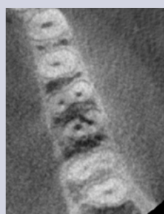
Fig. 4b. Axial CBCT slice of same tooth revealing a strip perforation of distal root at a level coronal to separated instrument.