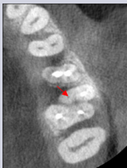
Fig 3. Axial CBCT slice of maxillary left quadrant. Note missed MB2 canal of tooth #14.

Assessment of Tooth Morphology and Complications: Root morphology and bony topography can be visualized in 3-D, as can the number of root canals and whether they converge or diverge from each other. Unidentified and untreated root canals may be identified using axial slices, which may not be readily identifiable with periapical radiographs. 2,26 The efficacy of CBCT as a modality to accurately identify the presence of second mesiobuccal canals in maxillary first and second molars has been evaluated. 28 The CBCT images accurately identified the presence or absence of the MB2 canal in 78.95% of samples. Statistical analysis showed that there was no significant difference in the ability of CBCT scanning to detect the MB2 canal when compared with the gold standard of clinical sectioning. Additionally, CBCT images have clearly demonstrated the presence of untreated or missed canals intraoperatively or in root-filled teeth, as well as complications ( i.e. , perforations) (Figures 3-5). As such, it appears that the use of CBCT for nonsurgical as well as surgical retreatment can be quite advantageous to the clinician.