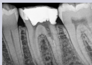
Fig. 4a. Periapical radiograph of tooth #19 with separated instrument in distal root.