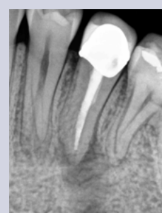
Fig. 5a. Periapical radiograph of tooth #20. There is an associated radiolucency at the apex of this root-filled tooth.