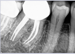
Fig. 2a. Periapical radiograph of tooth #30.

Detection of Apical Periodontitis: CBCT enables the detection of radiolucent findings before they are visualized on conventional radiographs (Figures 2a and 2b). 19-24 Lesions in the cortical bone can only be detected radiographically when there is perforation of the bone cortex, erosion from the inner surface of the bone cortex, or extensive erosion or defects on the outer surface. It is known that periapical lesions in cancellous bone cannot be detected radiographically. 25